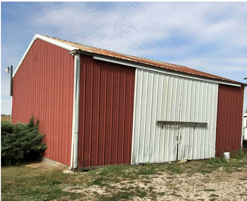
30' x 35' Morton Shed, partial concrete floor

3939 Garnette Ct. Naperville, IL 60564 Phone: 630-730-2975