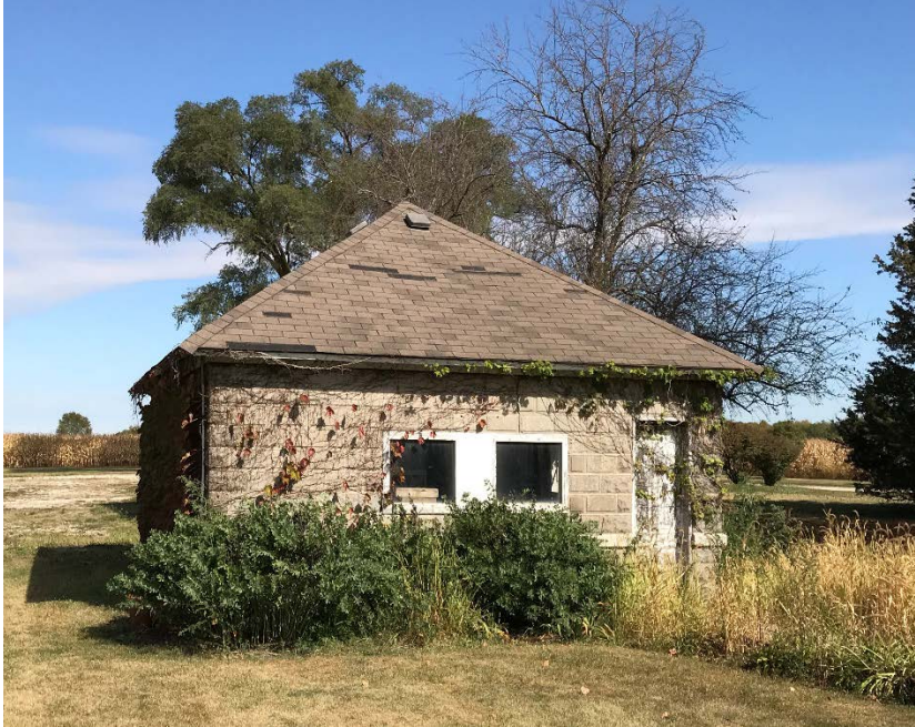
Concrete block garage

4405 Van Dyke Road Minooka, IL Kendall County, Parcel 09-05-400-021, 5.72 Acres